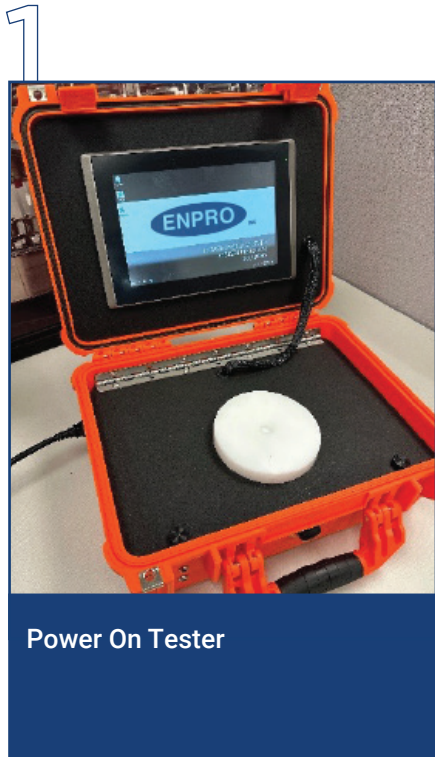
Power On Tester